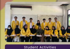
Student Activities Implementing MID/UAS Courses