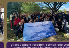
Street Vendors Research, Service, and Study Community Behavior in Karang Indah Village