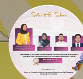
BRONZE MEDAL GENERAL CATEGORY - INNOVATION 2024