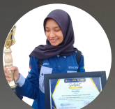
BEST VOLUNTEERS IN THE YOUNG ASSISTED VILLAGE LEADER CATEGORY AWARD 2023