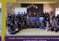
Street Vendors for Entrepreneurship Courses in Bakumpai Village