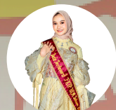
DUTA TERFAVORITE PKIP ULM 2024