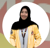
SEA TEACHER BATCH 9 AT THE UNIVERSITY OF THE IMMACULATE CONCEPTION PHILIPPINES