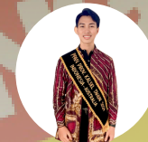
REPRESENTATIVES OF PPN SOUTH KALIMANTAN PROVINCE 2024 INDONESIA AUSTRALIA