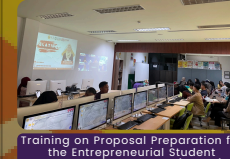
Training on Proposal Preparation for the Entrepreneurial Student Development Program (P2MW)