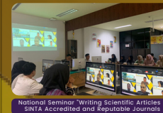
National Seminar "Writing Scientific Articles in SINTA Accredited and Reputable Journals"