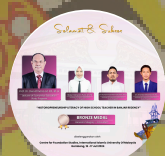
BRONZE MEDAL GENERAL CATEGORY - INNOVATION 2024