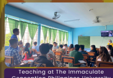
Teaching at The Immaculate Conception Philippines University