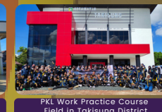
PKL Work Practice Course Field in Takisung District