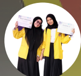
3 RD PLACE & BEST SPEAKERS IN THE 2022 INDOONESIAN STUDENT DEBATE COMPETITION (KDM)