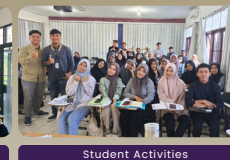
Student Activities Lecture Atmosphere