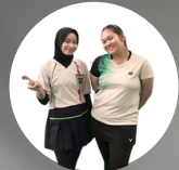
1 ST PLACE IN WOMEN'S DOUBLES BADMINTON AT UNIVERSITY LEVEL 2024