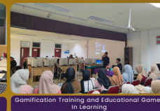
Gamification Training and Educational Games In Learning