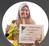
1 ST PLACE IN DIGITAL LEARNING MEDIA IN THE 2022 NATIONAL SOCIAL SCIENCE CATEGORY