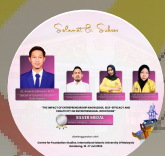
SILVER MEDAL GENERAL CATEGORY - TEACHING & LEARNING 2024