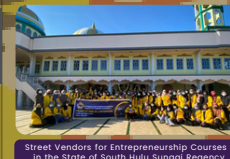
Street Vendors for Entrepreneurship Courses in the State of South Hulu Sungai Regency