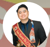
DUTA RUNNER UP 2 PKIP ULM 2024