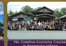
PKL Creative Economy Course in Panggung Village