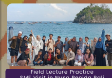
Field Lecture Practice SME Visit in Nusa Penida Bali