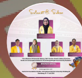
BRONZE MEDAL STUDENT CATEGORY - MANAGEMENT & ADMINISTRATION 2024