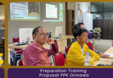
Preparation Training Proposal PPK Ormawa