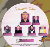
SILVER MEDAL GENERAL CATEGORY - MANAGEMENT & ADMINISTRATION 2024