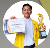
1 ST PLACE POSTER DESIGN NATIONAL LEVEL 2024