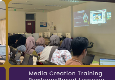
Media Creation Training Powtoon-Based Learning