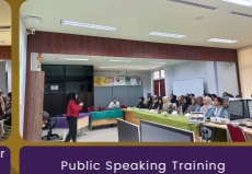
Public Speaking Training