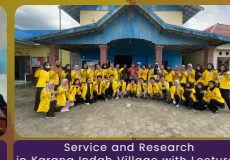
Service and Research in Karang Indah Village with Lecturers