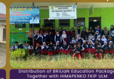
Distribution of BRITAN Education Package Together with HIMAPENKO FKIP ULM at SDN Basrih 10 Banjarmasin