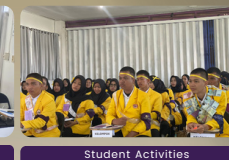
Student Activities PKKM Study Program