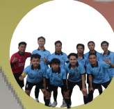
3 RD PLACE FUTSAL TOURNAMENT (TUMBUK) VOL 3 2023